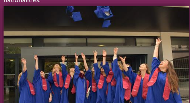
"Europubhealth brought the world to me in one classroom"

Europubhealth has been recognized as a Erasmus Mundus Joint Master Degree of Excellence and supported by the Erasmus+ programme of the European Union since 2006. More than a decade after its launch, the programme now enjoys a vibrant international network of public health professionals and academics, and more than 435 graduates of 86 different nationalities