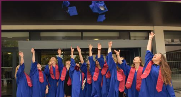
"Europubhealth brought the world to me in one classroom"

The programme has been supported by the European Commission as an Erasmus Mundus Master Degree with a label of excellence since 2006. Thanks to its 11 years of existence, the programme benefits from a vibrant international network of public health professionals and academics, and more than 250 graduates of 70 nationalities.